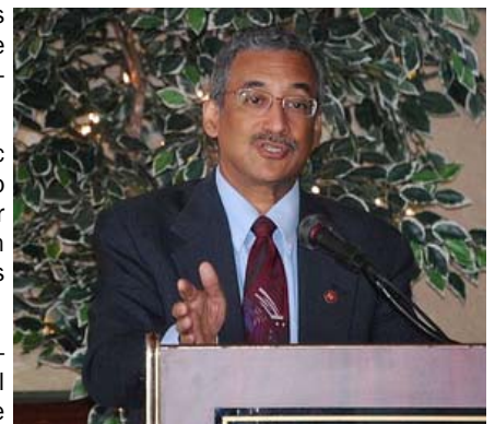
Congressman Bobby Scott from the Third Congressional District of Virginia spoke at Virginia Reentry Conference in May.