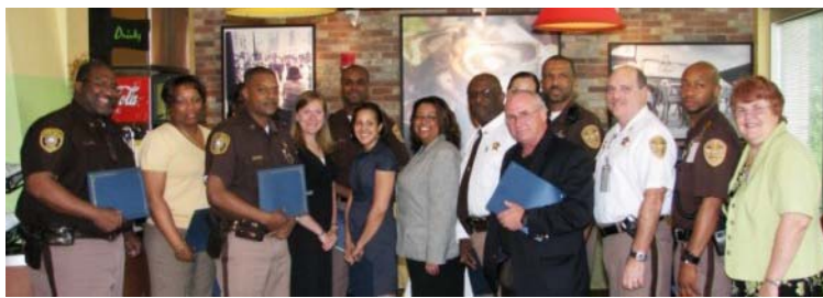
OAR Staff and Volunteers recognized Captains, Sergeants, Deputies, and Staff from the Alexandria Detention Center and the Arlington County Detention Facility during the Annual Volunteer and Partnership Appreciation Event.