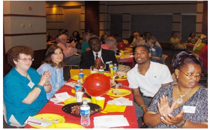
Citizens from all walks of life heard from clients at the OAR Second Chance Breakfast