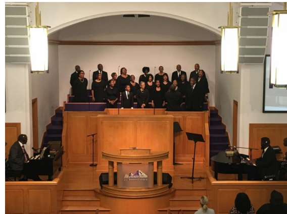
Creative Arts Ministries Choir of Mount Zion

Special thanks to the sponsors of this event: