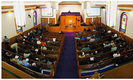
The event was held at and hosted by Mount Zion Baptist Church.