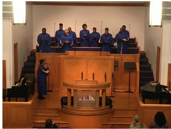
The Third Baptist Church Mass Choir