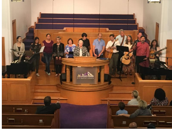
Our Lady Queen of Peace Folk Choir