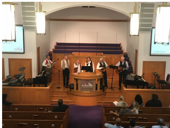
Shrine Monsters of Immanuel Church-on-the-Hill