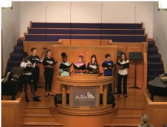
St. Mary's Boys and Girls Choir