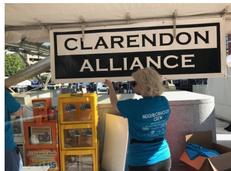
A Community Service volunteer assists at Clarendon Day on September 23rd

Some events that the Community Service participants assist with each year include the Arlington County Fair, Columbia Pike Blues Festival, Nations Triathlon, Charles E. Beatley Library Annual Book Sale, Falls Church Farm Day, Taste of Arlington, and Clarendon Day, to name a few. The participants assist with set